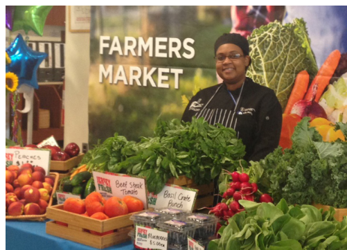
MSK's farmers market to create a healthier food environment in New York City hospitals

In 2017, MSK's Food and Nutrition Department continued to maintain its gold star status in the New York City Department of Health's Healthy Hospital Food Initiative. The initiative aims to create a healthier food environment in New York City hospitals and aligns to hospitals' missions of promoting health and wellness. By participating in the initiative, hospitals agree to adopt the New York City Food Standards, which are evidence-based nutrition criteria that ensure employees, visitors, and patients have better access to healthy food.