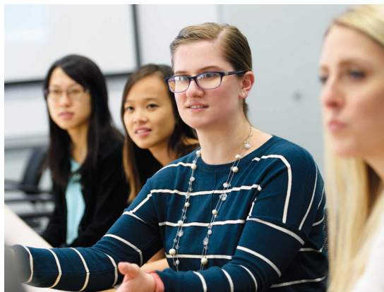
Specialty residency programs for pharmacists seeking careers in oncology

BECH plays a pivotal role in training students and young adults in the community to help direct their career growth. In 2017, BECH hosted ten college students with health or science majors and two mentor advisers from the Manhattan chapter of the National Coalition of 100 Black Women Signature Role Model program. Staff delivered presentations on patient and community education and outreach efforts in Harlem to help direct students toward the best career opportunities available.