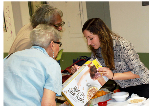
Serving the Hispanic community with cancer prevention and nutrition education

In 2017, MSK Community Access was developed as a network of ongoing partnerships with trusted local organizations to continuously learn how to best engage and serve the Hispanic population to increase familiarity with MSK and the services we provide. Continuous engagement with community members allows MSK to deliver on an essential part of our mission — education — while enabling members to seek and receive relevant health information from our staff.