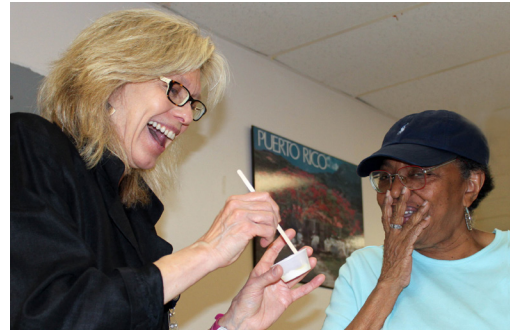
Cancer education also includes integrative medicine such as aromatherapy, acupuncture and massage therapy

In 2018, the initiative will continue its partnership with RAICES Senior Center and scale to new community partners in our target area.