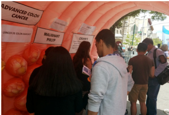
Raising colorectal cancer awareness with an interactive, educational “walk through” colon

PCORE addressed cancer risk factors through various programs. The Community Garden Project, in collaboration with the Green Bronx Machine, optimizes the nutrition of cancer patients in need