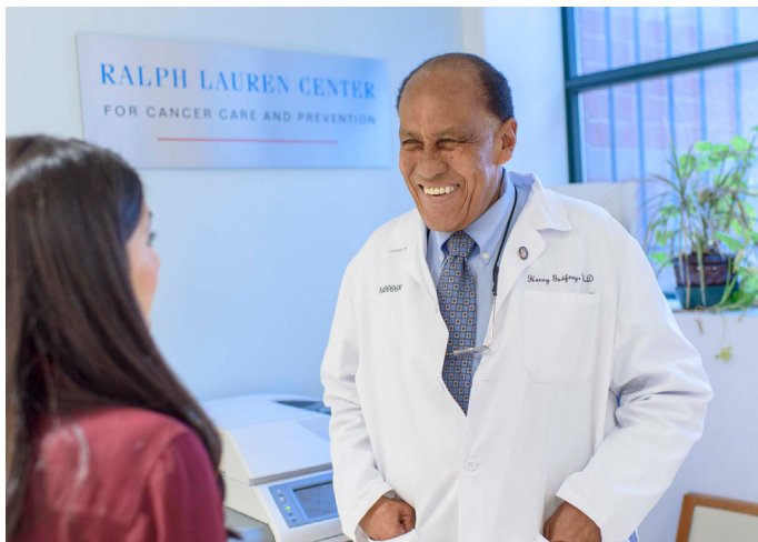
Cancer patient navigation and addressing health disparities in Harlem

The Ralph Lauren Center for Cancer Care (RLC), a New York State Article 28 Certified Diagnostic and Treatment Center, receives support from MSK to provide compassionate cancer diagnosis, prevention, and treatment services to all. Located in Harlem, the RLC further seeks to address the health disparities of increased death from cancer and other chronic diseases experienced by African Americans, Hispanics, and other racial and ethnic minorities; individuals of low income; and those without adequate health insurance. At the heart of its work is a patient care navigation model through which the RLC delivers a comprehensive, personalized approach to care.