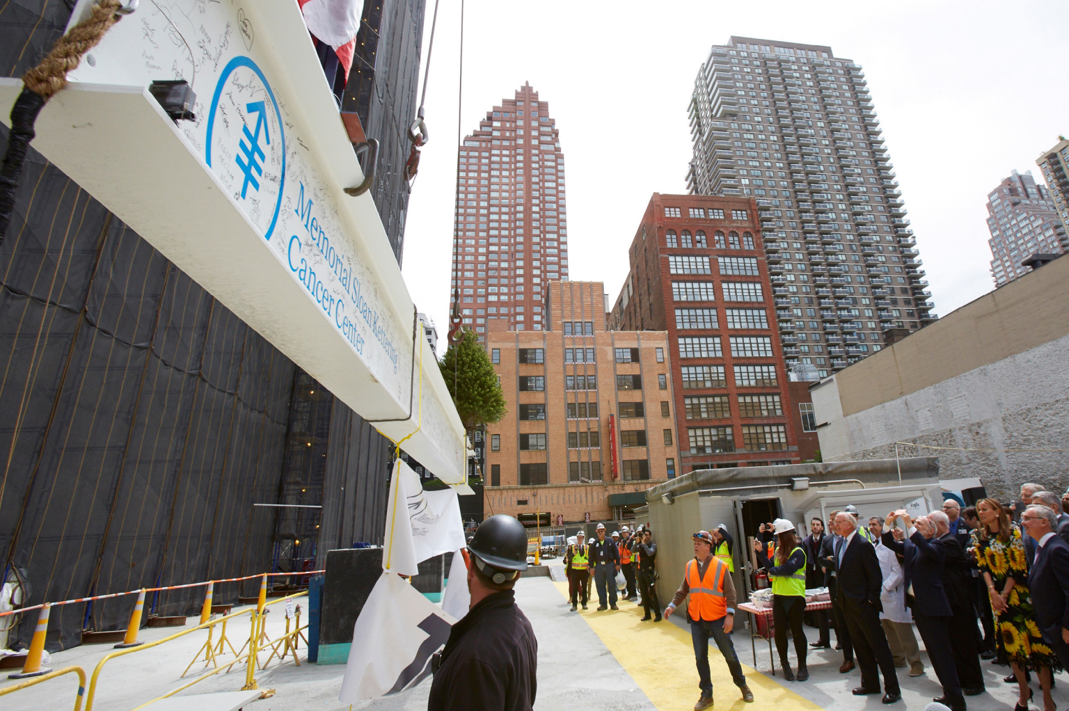
MSK's David H. Koch Center for Cancer Care under construction