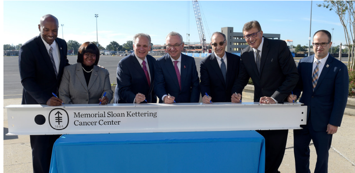
Nassau County and MSK leadership sign a beam to be used in construction of new MSK facility

MSK leadership and staff welcomed county officials, community leaders, and special guests to a site-beam-signing celebration, marking the construction of MSK Nassau, a 114,000-square-foot freestanding cancer treatment center. Upon MSK Nassau's opening in late 2019, MSK will close its current Rockville Centre facility and move its staff and services into the new Nassau facility. As at other outpatient MSK locations, patients will benefit from comprehensive cancer services and amenities in a single location, with more than 20 cancer doctors covering multiple disciplines. The building and adjacent five-story parking garage will neighbor NYCB Live, the home of the new Nassau Veterans Memorial Coliseum.