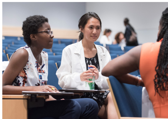
Supporting careers in medicine among minority and female medical students

The CME program sponsored numerous activities to address unmet needs in diverse communities, including a seminar for healthcare professionals titled “The LGBT Health Workforce Conference 2017.” This one-day conference featured the country’s leading researchers, clinicians, survivors, advocates, and policy experts on cancer in lesbian, gay, bisexual, transgender, and queer (LGBTQ) communities. Topics covered included barriers to care, tobacco and cancer, risk behaviors among LGBTQ youth, transgender people and cancer, human papillomavirus and vaccination, HIV and non-AIDS-defining cancers, breast cancer, survivorship challenges, and creating a welcoming environment.