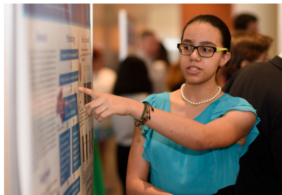
Exposing high school students to career opportunities in translational research

The Human Oncology and Pathogenesis Summer Student Program offers promising high school students an unparalleled opportunity to work side by side with world-class researchers in a state-of-the-art facility to develop and test new targeted drug therapies. The program is committed to attracting students with an interest in translational research and strongly encourages minority students who are underrepresented in the sciences to apply. In 2016, 27 high school students participated in the Summer Student Program.