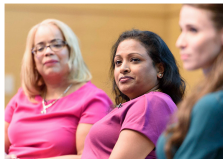
Free community lecture series

Our clinicians, researchers, nurses, and staff members are available to lecture on cancer-related topics to corporate, school, faith-based, and community-based organizations. Presentations in 2016 in our Regional Care Network areas were provided to numerous organizations, including the Cancer Support Community, Fellowship Village, and Somerset County Court House in New Jersey; and Ahavat Shalom of Great Neck, Central Islip High School, Deer Park High School, Families United in Health, Freeport Recreation Center, Gilda's Club of Westchester, Mather Hospital, and the New York Institute of Beauty in New York.