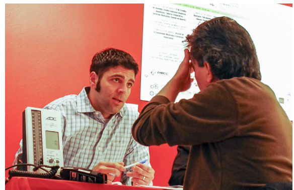
Educating members of the Mexican-American community during Binational Health Week

In 2017, roughly 12,500 people received health information and 600 people received help for referrals to social services and support. In addition to the consulate-based workshops, we educated 1,247 community members about breast cancer and healthy lifestyle choices during Binational Health Week outreach events with our consulate partner agency. We reviewed the national screening guidelines, checked participants' eligibility for insurance coverage, and made 40 referrals for screening. In 2018, we will continue to partner with the Mexican consulate and our community-based and healthcare partner organizations to serve the Mexican community. Our goal is to increase the utilization of breast and colorectal cancer early-detection services by Mexican women and men by educating a total of 200 participants about breast and colorectal cancer and by directing 25 eligible women and men into screening. Additionally, we will provide information and screening services to more than 800 participants.