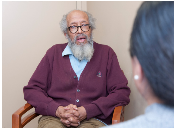
Addressing tobacco dependency by meeting unique needs of patients

Providing professional training and continuing education is an important goal of MSK's TTP. Observerships and student internships extend the program's reach well beyond our walls. The Translational Research