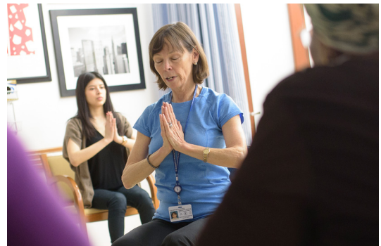
Chair Yoga for Survivors of Cancer

MSK hosted annual events in observance of National Cancer Survivors Day in 2016 and 2017. Those in attendance heard keynote speakers describe their cancer experiences and received educational materials related to cancer survivorship and support. Approximately 500 participants attended the Manhattan events, 1,000 attended the Long Island events, 750 attended the New Jersey events, and 625 attended the Westchester County events.