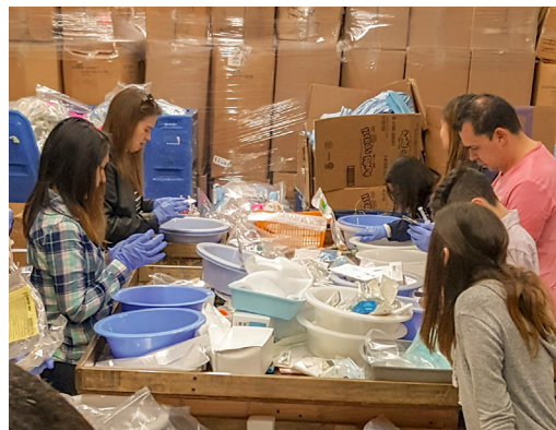
MSK staff volunteers sort thousands of supplies to support health initiatives abroad

MSK took additional steps in support of ongoing relief efforts, responding to the unfolding humanitarian crises in the wake of natural disasters that hit the southern United States, Mexico, Puerto Rico, and a number of Caribbean islands in 2017. MSK offered its health professional resources to consult with the Greater New York Hospital Association (GNYHA) and New York State Department of Health team to Puerto Rico. MSK also prepared and donated a shipment of oncology drugs for GNYHA and AFYA to deliver to doctors who were treating cancer patients in affected areas.