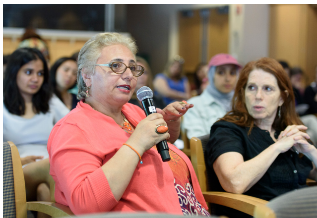
Immigrant Health and Cancer Disparities Conference

The Immigrant Health and Cancer Disparities Service (IHCD) coordinates a range of chronic disease prevention programs for underserved, immigrant, and multicultural populations. MSK increased the number of underserved individuals screened for cancer and cardiovascular disease through IHCD's community programs by 5 percent in 2017 and expect to increase this another 5 percent in 2018, in keeping with MSK's goals to address the New York State Department of Health's Prevention Agenda priorities. IHCD's programs, described below, are based in the community, and we partner with prominent community organizations: