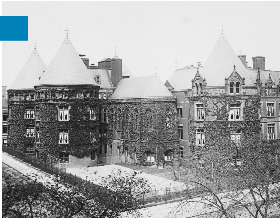
Memorial Sloan Kettering Cancer Center was founded in 1884 as New York Cancer Hospital on Manhattan's Upper West Side by a group that included John J. Astor and his wife, Charlotte.

For more than a century, the Head and Neck Service at Memorial Sloan Kettering Cancer Center has provided leadership and innovation in the field of head and neck surgery and oncology.